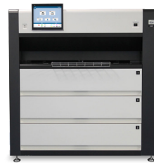
KIP 940 Print Copy & Scan System