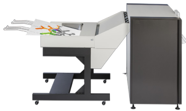
KIP 940 Print System