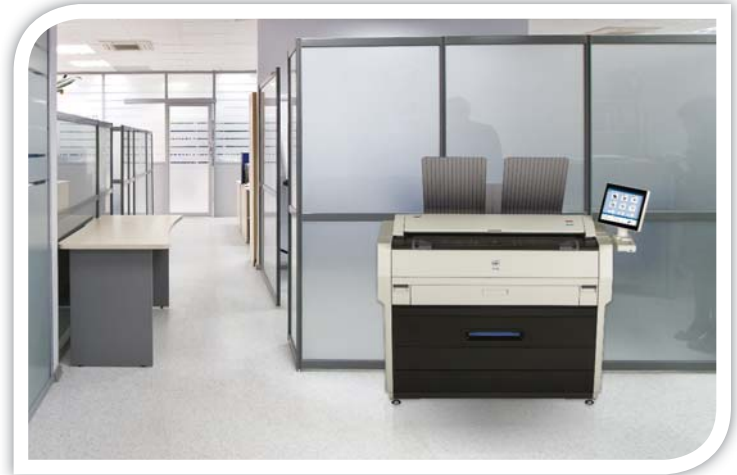
Space Saving Design