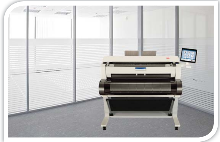
Space Saving Design