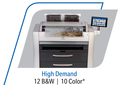
High Demand 12 B&W | 10 Color*