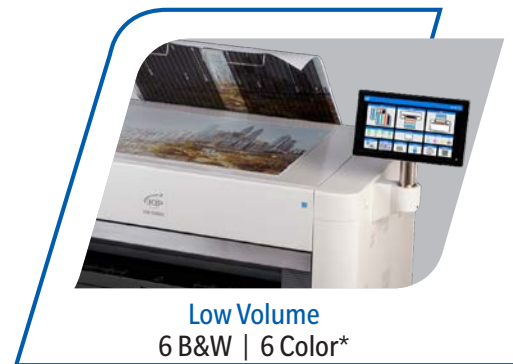
Low Volume 6 B&W | 6 Color*

From our powerful print engines and smart software technology to our incredible image quality we have designed a KIP 700 C Series to meet the demands of today and tomorrow's print requirements.