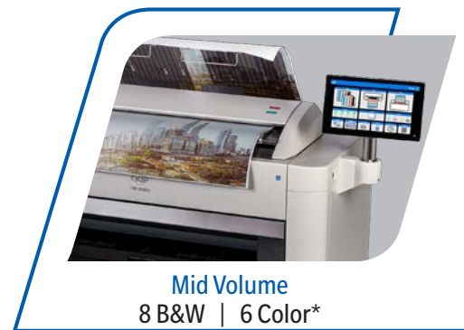
Mid Volume 8 B&W | 6 Color*